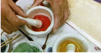
Formulation of color